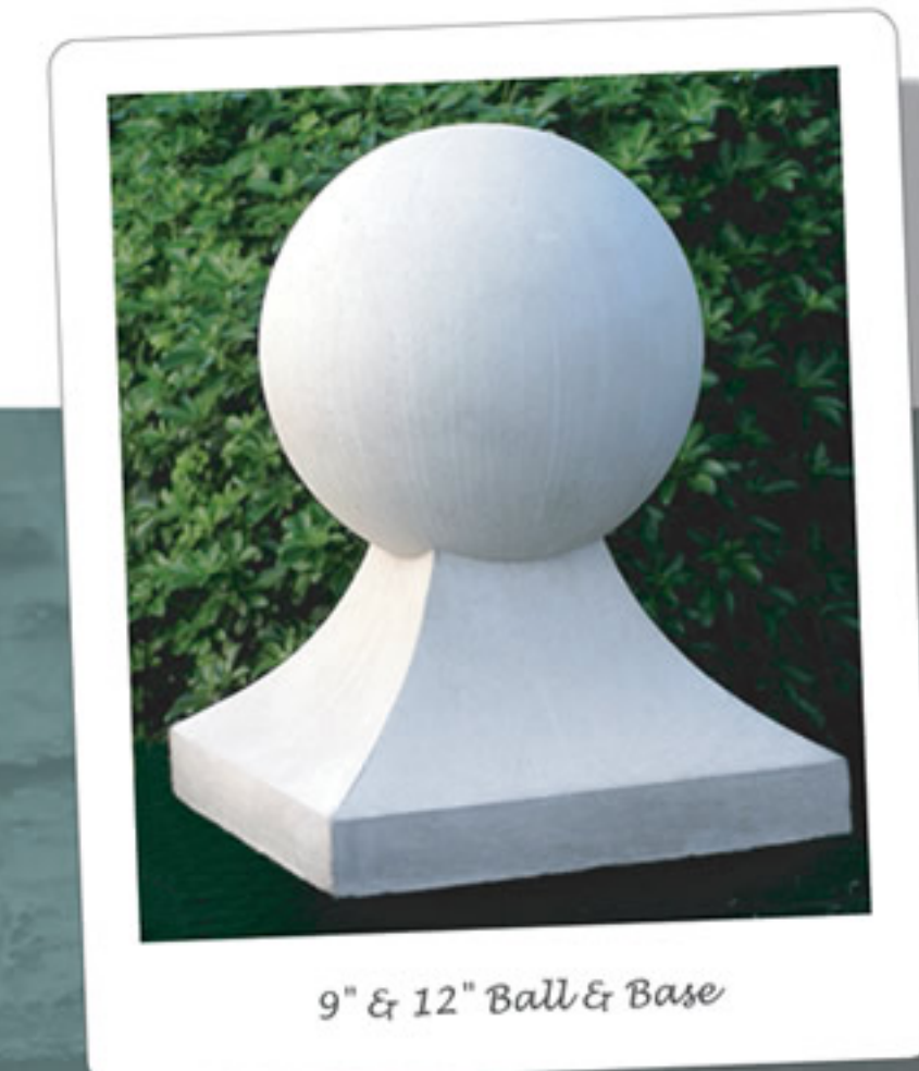
9" & 12" Ball & Base