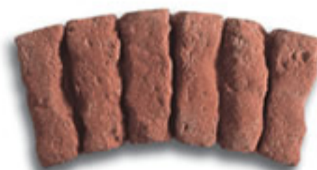
Curved Antique Brick