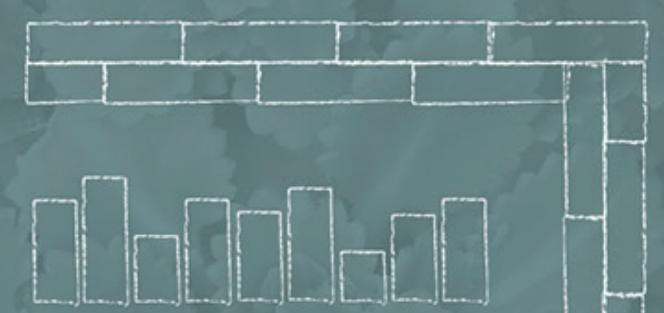
Various lengths of Sleeper stone planted vertically in the ground create an interesting border.