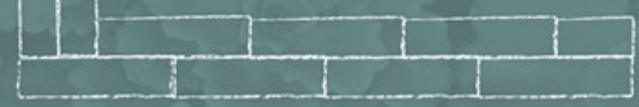
An effective use of sleeperstones to create simple flower bed borders and attractive promenades.